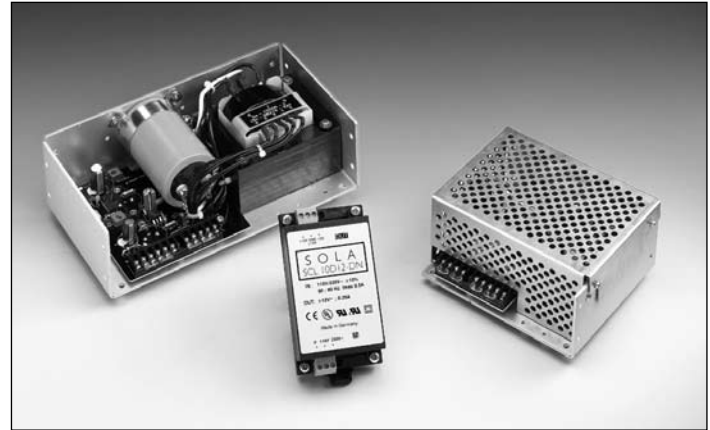
Linear Power Supplies for a broad range of applications

The small size, lightweight and high efficiency of the switching products give them significant advantages over the linear technology products (SolaHD's SL and 83 series). SolaHD switching products provide well filtered and regulated DC of typically less than 1% deviation from the nominal output voltage.